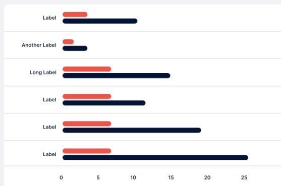
Preventative Maintenance Schedule